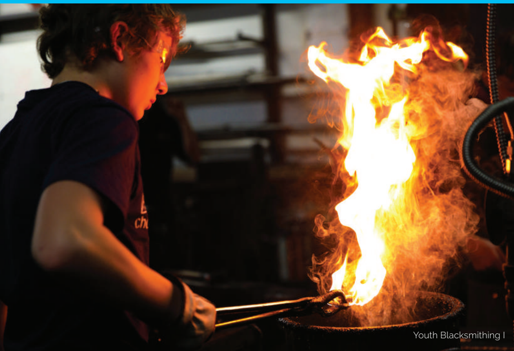
Youth Blacksmithing I

UPCOMING CLASSES JAN–JUL 2020 ▶ TheCrucible.org/shop