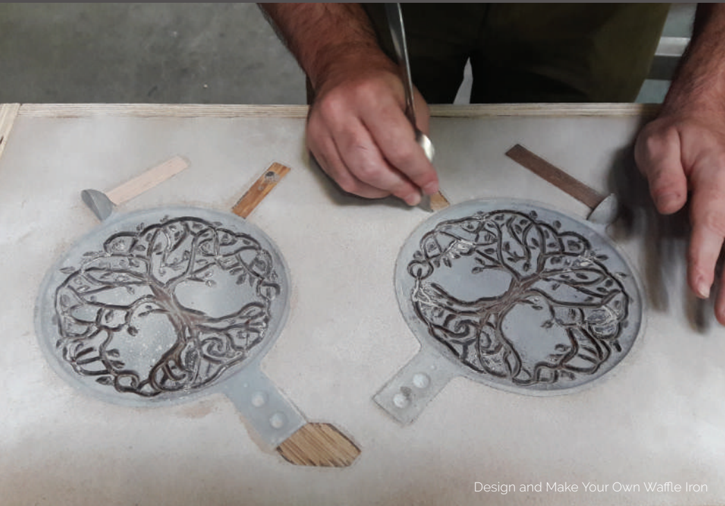
Design and Make Your Own Waffle Iron

UPCOMING CLASSES JAN-JUN 2020 ▶ TheCrucible.org/shop