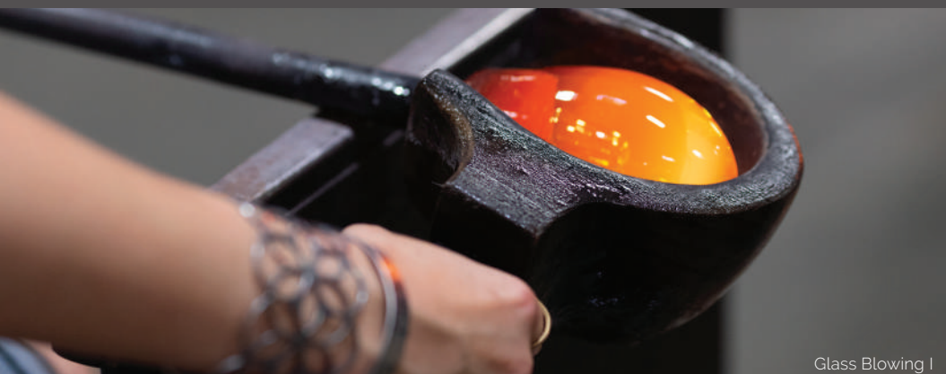
Glass Blowing I

UPCOMING CLASSES JAN–JUN 2020 ▶ TheCrucible.org/shop