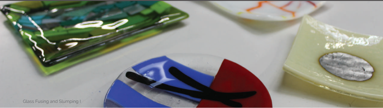
Glass Fusing and Slumping I

UPCOMING CLASSES JAN-JUN 2020 ▶ TheCrucible.org/shop