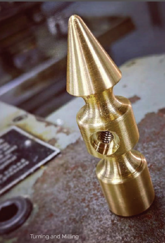
Turning and Milling

UPCOMING CLASSES JAN–JUN 2020 ▶ TheCrucible.org/shop