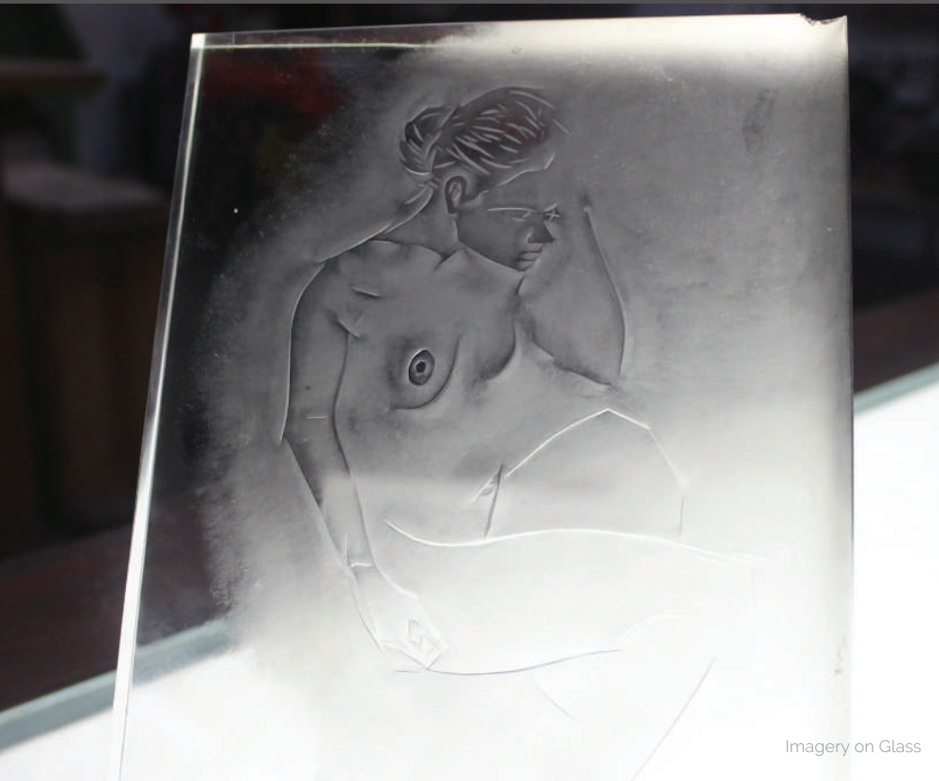
Imagery on Glass

UPCOMING CLASSES JAN-JUN 2020 ➤ TheCrucible.org/shop