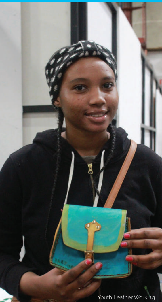
Youth Leather Working

UPCOMING CLASSES JAN–JUL 2020 ▶ TheCrucible.org/shop