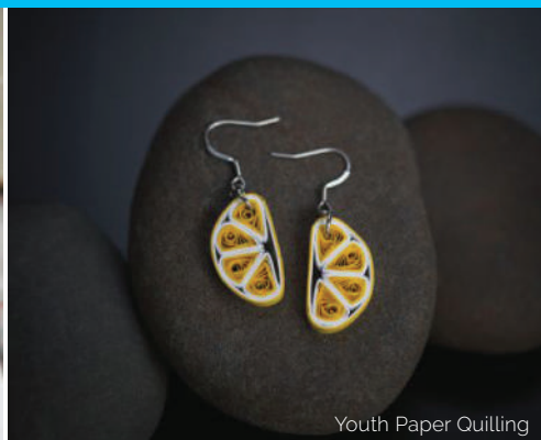
Youth Paper Quilling