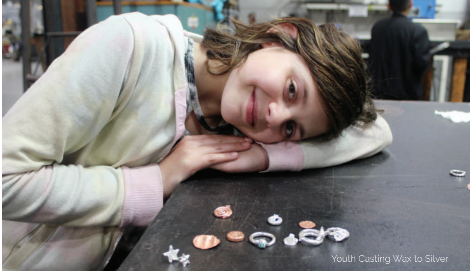
Youth Casting Wax to Silver