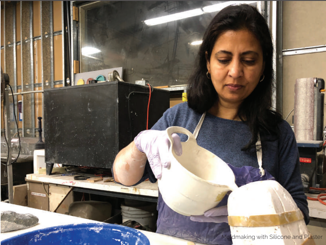
Moldmaking with Silicone and Plaster

UPCOMING CLASSES JAN–JUN 2020 ▶ TheCrucible.org/shop