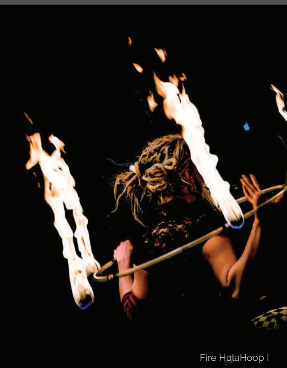
Fire HulaHoop I

UPCOMING CLASSES JAN-JUN 2020 ➤ TheCrucible.org/shop